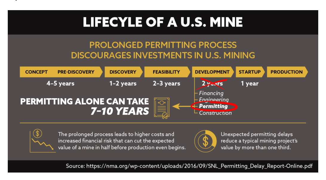
The U.S. is increasingly vulnerable to supply chain disruptions and retaliation from geopolitical adversaries due to our ever-increasing reliance on imports for these essential resources. Less than half of the mineral needs of U.S. manufacturing are met by domestically produced minerals, which leaves our economy and national security at a

Nearly two decades ago, the U.S. attracted almost 20 percent of the world's total mining investment. Unfortunately, in the time since, there has been a sharp decline in U.S. exploration investment. This is not due to lack of resources, but rather a lack of confidence in the U.S. as a viable mining jurisdiction in which to invest hundreds of millions of dollars in upfront costs due to duplicative, inefficient and costly permitting timeframes, making the U.S. more dependent on other countries for metals. It currently takes between seven to 10 years – or longer – to permit a mine in the U.S. In Canada and Australia, which have environmental standards comparable to the U.S., it takes two to three years to complete the same process.