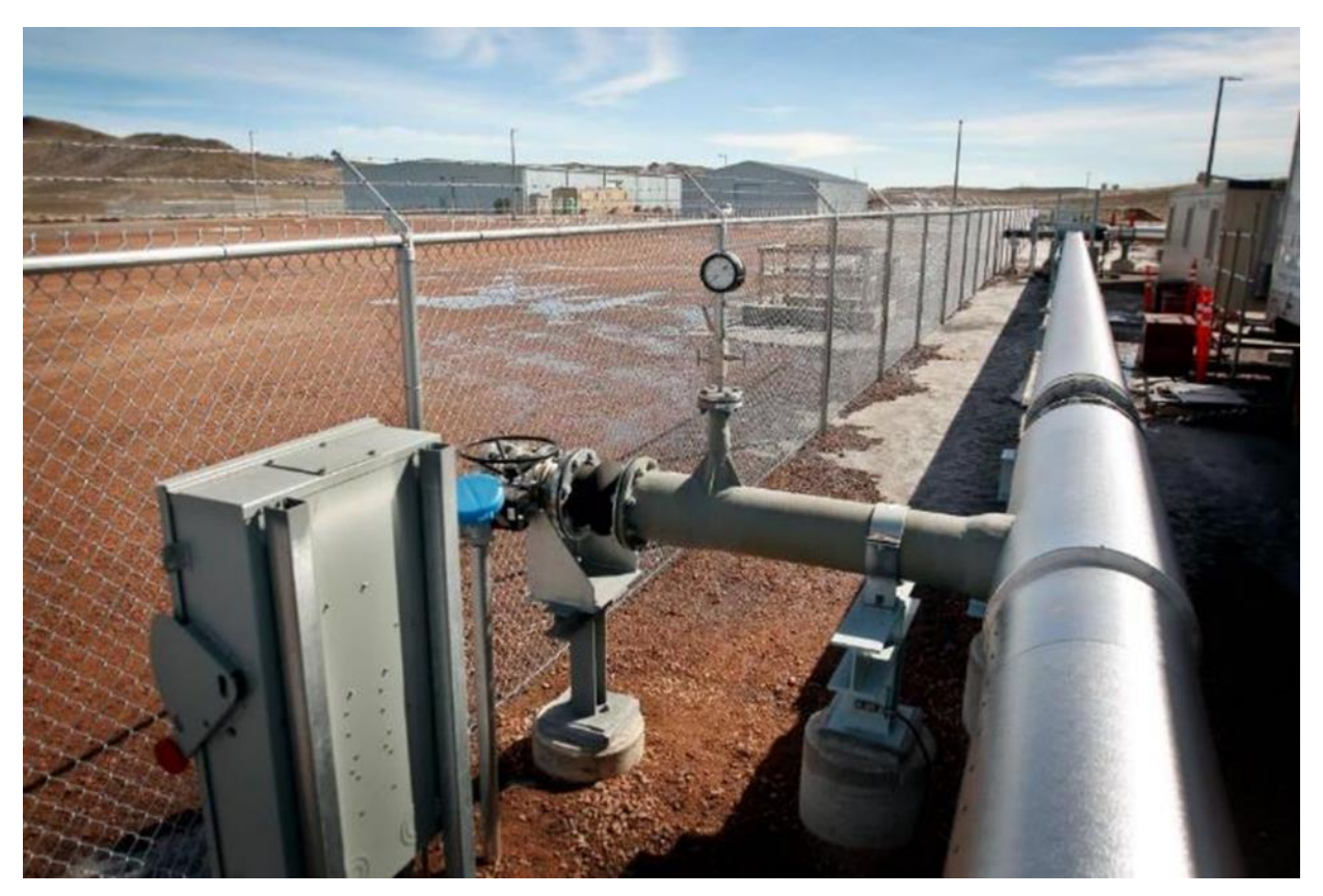
Fig 2. – Small Test Bay tie-in

To date, we have raised $21 million in funding, $15 million from the State of Wyoming, $5 million from Tri-State G&T, and $1 million from NRECA. While we believe there is an important role for the federal government to play in advancing technology and we would welcome such a partnership, not one cent of federal funding has been utilized in the costs of the facility, although some of our research tenants have received Department of Energy grants to conduct their projects on site.