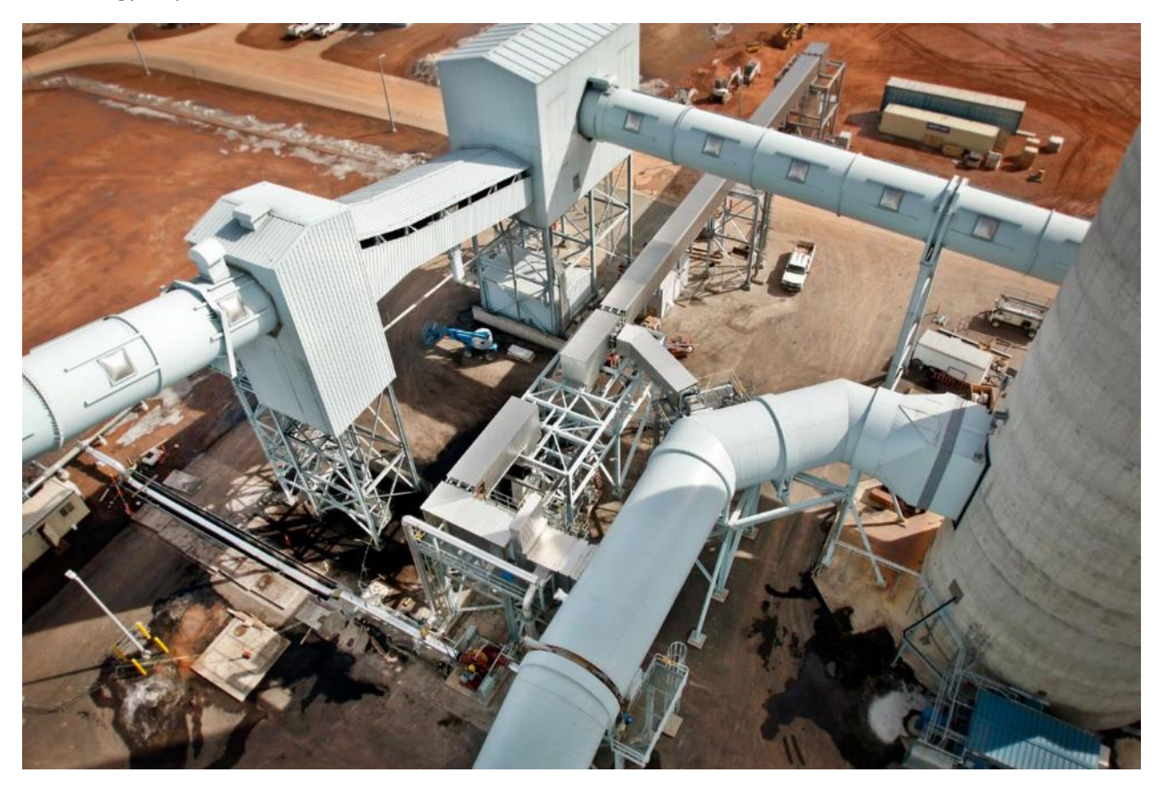
Fig. 3 – Overview of ITC connection to Dry Fork Station

The one constant variable for all of these state entities is a push to commercialization. Every project needs to continuously track costs and economics, because without a demonstrable path to commercialization, all you have is an interesting idea. Strong partnerships with the private sector, especially those industries that would ultimately be a customer of the technology, helps ensure our research objectives are aligned with their economic needs. A great example of how this has been successful for Wyoming is the ITC Stakeholder Committee. This committee is comprised of representatives from major utilities who are involved in the technology evaluation processes for their various companies. These utilities are invaluable in determining the commercial appeal of a particular technology or process.