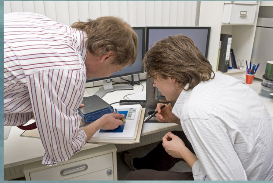
Research and Development