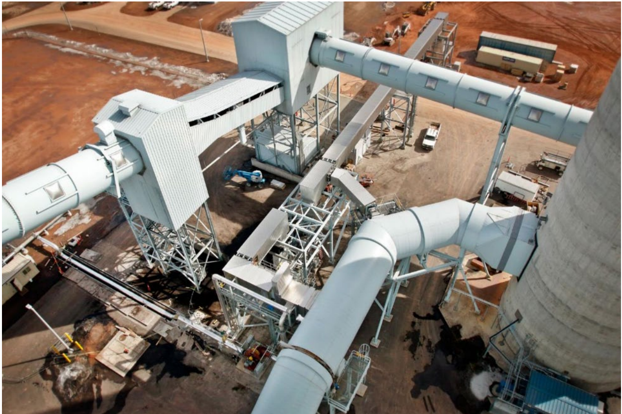
Fig. 3 – Overview of ITC connection to Dry Fork Station

The one constant variable for all of these state entities is a push to commercialization. Every project needs to continuously track costs and economics, because without a demonstrable path to commercialization, all you have is an interesting idea. Strong partnerships with the private sector, especially those industries that would ultimately be a customer of the technology, helps ensure our research objectives are aligned with their economic needs. A great example of how this has been successful for Wyoming is the ITC Stakeholder Committee. This committee is comprised of representatives from major utilities who are involved in the technology evaluation processes for their various companies. These utilities are invaluable in determining the commercial appeal of a particular technology or process.