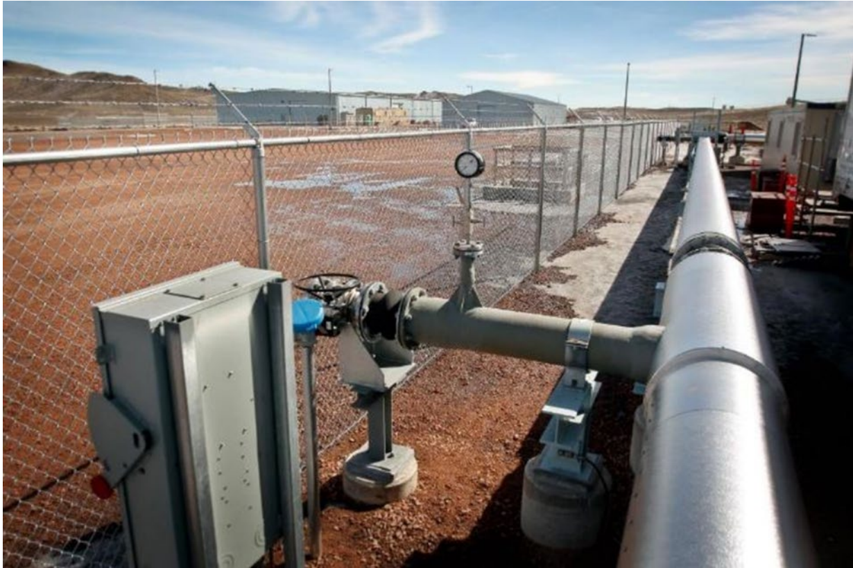
Fig 2. – Small Test Bay tie-in

To date, we have raised $21 million in funding, $15 million from the State of Wyoming, $5 million from Tri-State G&T, and $1 million from NRECA. While we believe there is an important role for the federal government to play in advancing technology and we would welcome such a partnership, not one cent of federal funding has been utilized in the costs of the facility, although some of our research tenants have received Department of Energy grants to conduct their projects on site.