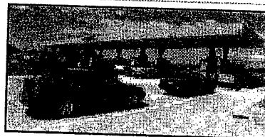
Drivers line up Thursday afternoon to buy gas on ...