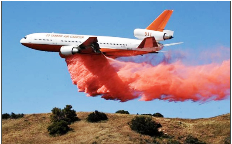
Figure 3: Example of a DC-10 Very Large Airtanker Dropping Retardant