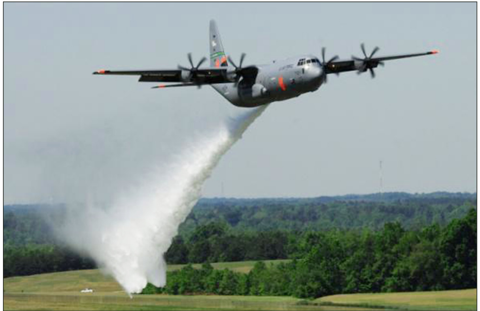
Figure 4: Example of MAFFS-equipped C-130