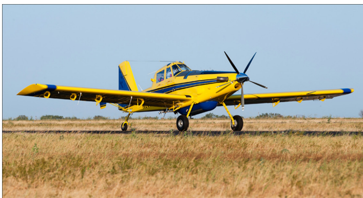
Figure 1: Examples of Single-Engine and Large Airtankers Used in Wildland Fire Suppression