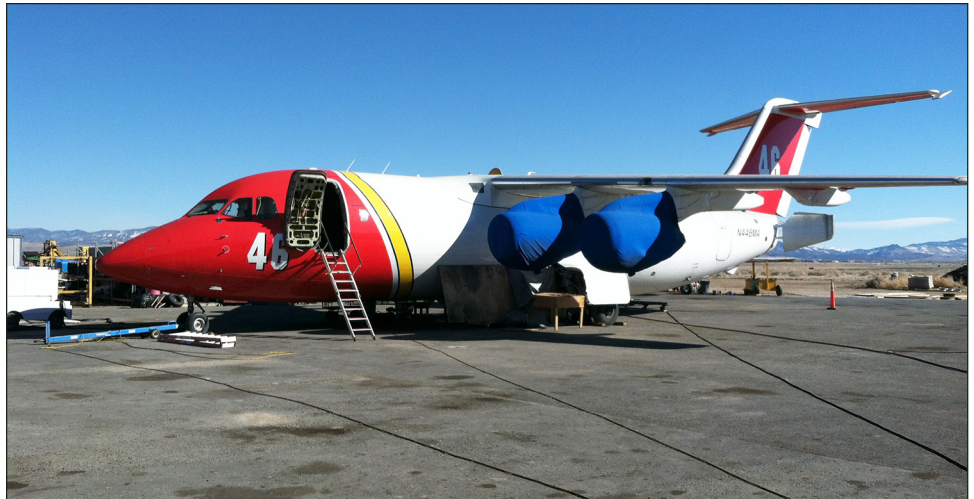
Figure 5: Example of a “Next-Generation” Large Airtanker (BAe-146)