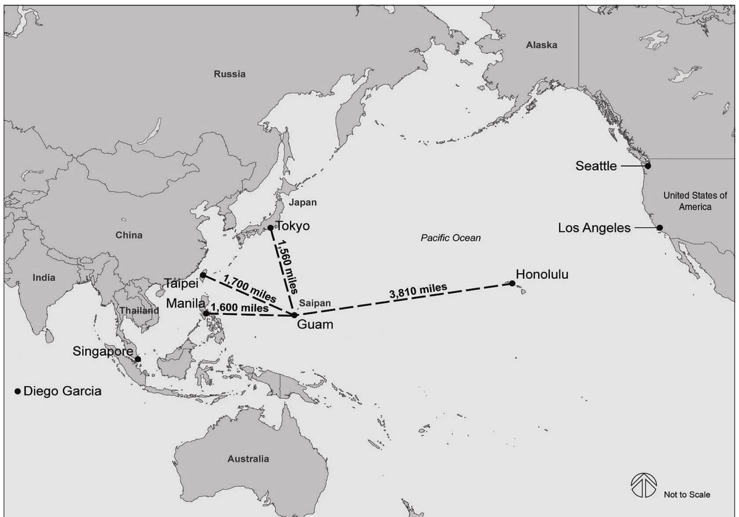
Figure 1: Location of Guam

Guam is the westernmost territory of the United States and is located in the Pacific Ocean approximately 3,810 miles southwest of Honolulu, Hawaii; 1,600 miles east of Manila, the Philippines; and 1,560 miles southeast of Tokyo, Japan (see fig. 1).