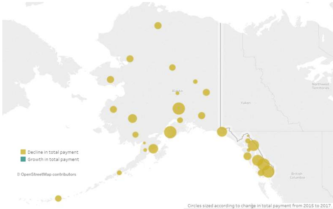
Estimated Change in Forest Service, BLM O&C, USFWS RRS, and PILT Payments, FY 2015 to FY 2017